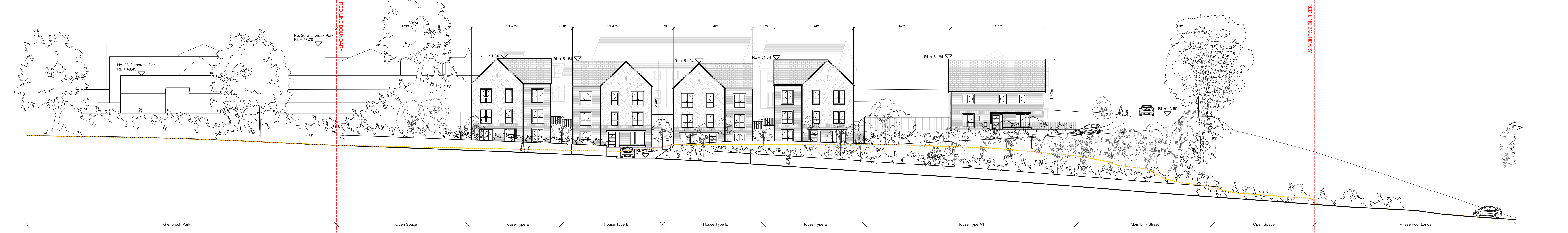
Elevation 01 - Kilcoole Road - Part 1 Scale:1:200