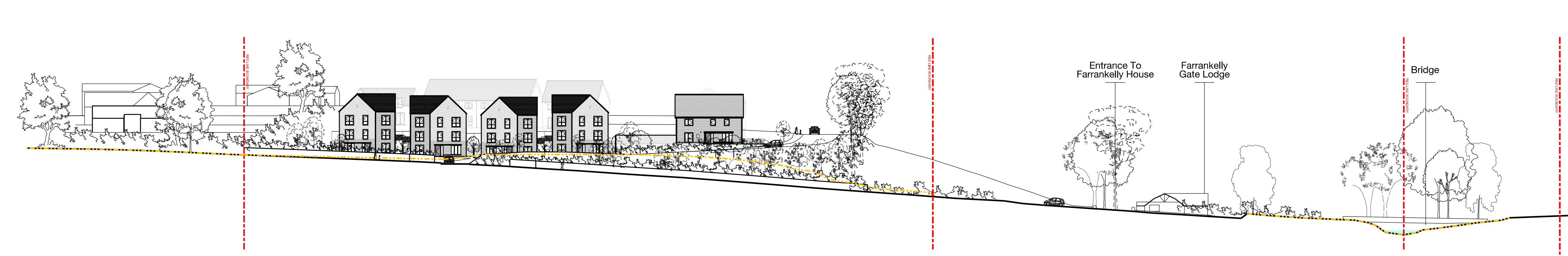
Elevation 01 - Kilcoole Road Scale:1:500